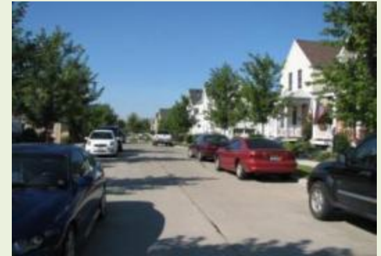
On the Street