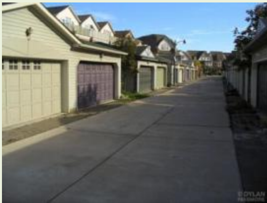
Rear Garage (alley)